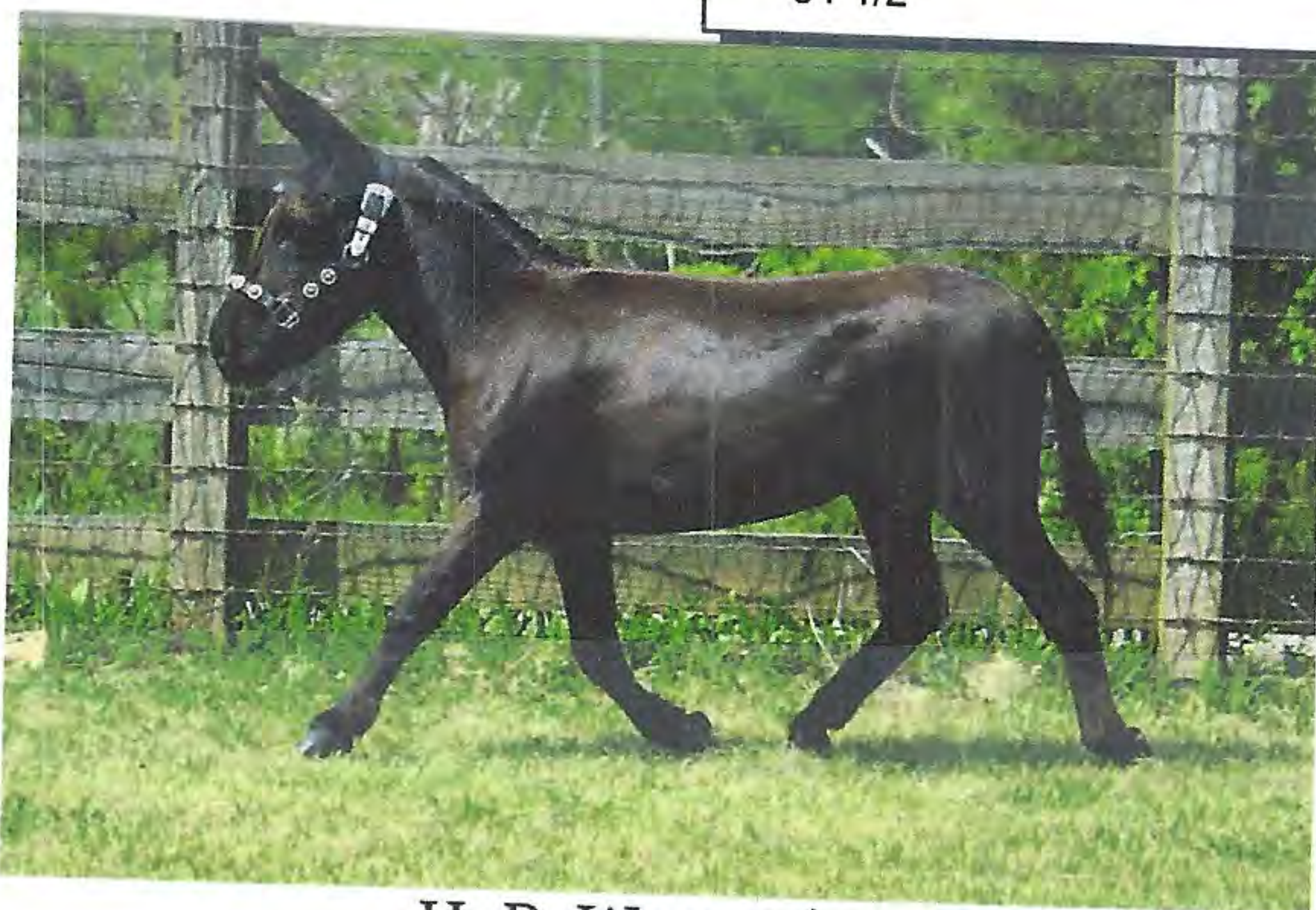
H. R. Wow 2.jpg

The American Donkey and Mule Society, PO Box 1210, Lewisville TX 75067 www.lovelongears.com/ (972) 219-0781 The American Donkey and Mule Society is not responsible for errors in information submitted to the registry.